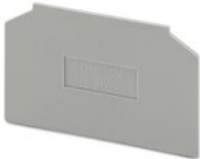
End cover, length: 69 mm, width: 2 mm, height: 41 mm, color: gray

Please be informed that the data shown in this PDF Document is generated from our Online Catalog. Please find the complete data in the user's documentation. Our General Terms of Use for Downloads are valid ( http://phoenixcontact.com/download )